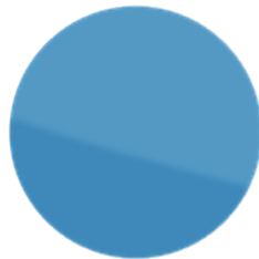
RAL 5012 LIGHT BLUE GLASS