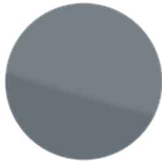
RAL 7031 BLUE GREY GLASS