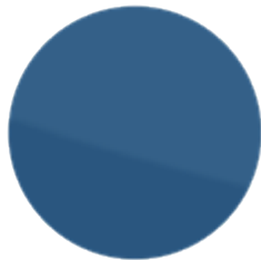
RAL 5010 GENTIAN BLUE GLASS