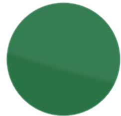
RAL 6029 MINT GREEN GLASS