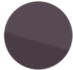
RAL 4007 PURPLE VIOLET GLASS