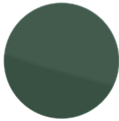
RAL 6005 MOSS GREEN GLASS