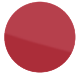
RAL 3020 TRAFFIC RED GLASS