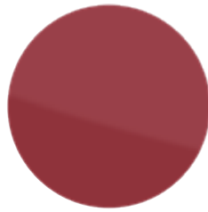
RAL 3002 CARMINE RED GLASS