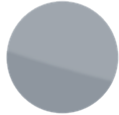
RAL 7045 TELE GREY GLASS