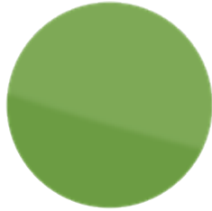
RAL 6018 YELLOW GREEN GLASS