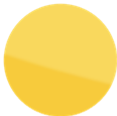
RAL 1018 ZINC YELLOW GLASS